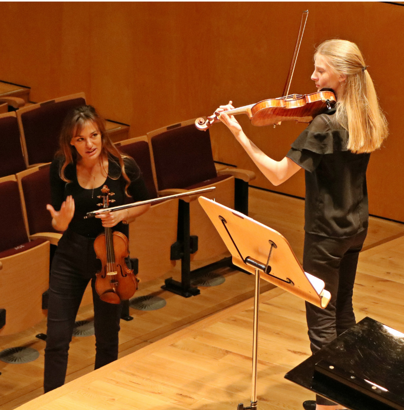
Masterclass with alumna Nicola Benedetti, 2019

Named after our founder, the Menuhin Circle brings together people who donate between £1,000 - £5,000 per year to our Annual Fund for a minimum of three years.