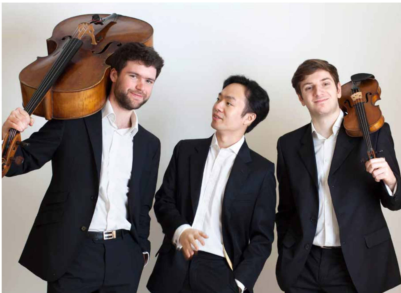
Linos Piano Trio

On the afternoon of Saturday 9 July 2016 we will be holding our second Reunion for Alumni and Former Staff. Please put the date in your diary. Details to follow.