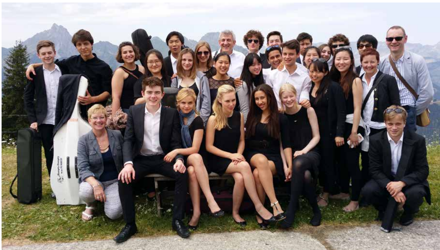
YMS tour party in Gstaad.

It was a very successful and memorable trip. The students were a great advertisement for the School and a credit to themselves, the School and their parents. Well done all!