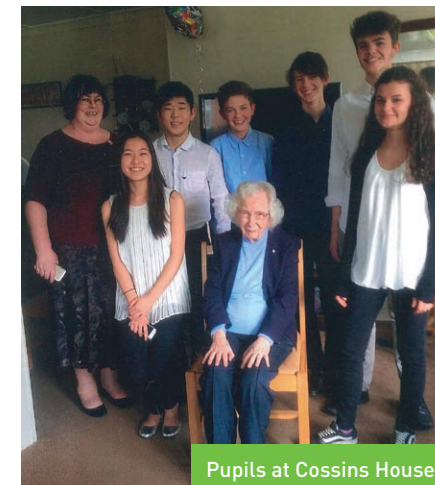
Pupils at Cossins House

Students from the Yehudi Menuhin School came to perform for the whole school. Children were so excited and engaged to see children of similar ages to themselves performing and demonstrating such high levels of performance skills, mastery of technique and confidence. Many of our students were keen to ask questions of the students and teachers during the session and had many further questions in lessons that followed. It has really helped children feel more confident exploring music that is from the classical genre. It has provided an excellent link into exploring some of the pieces from BBC Ten Pieces as part of our next module of work as they have recognised many of the instruments they have seen in the orchestral film clips. One of our students has moved to join The Yehudi Menuhin School to continue her studies as a violinist.