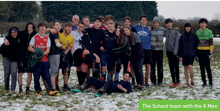
The School team with the X Men

certainly deserved the Man of the Match title with a goal and great contribution to his team. With this result the current students managed to extend their winning streak. The reunion was celebrated in style with refreshment. It was great seeing everyone and we hope to have a keen team of alumni back next year.