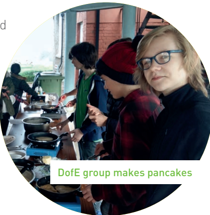
DofE group makes pancakes

Our Bronze Duke of Edinburgh group and I held a pancake sale on 21 February for charity, as part of the volunteering section of our award. We cooked pancakes to order and supplied a variety of delicious toppings. The sale was a complete success and we raised over £50. We were pleased to contribute to Action Medical Research for Children, a charity which can help young people like us have a future.