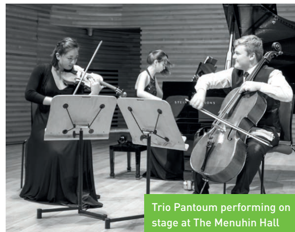
Trio Pantoum performing on stage at The Menuhin Hall