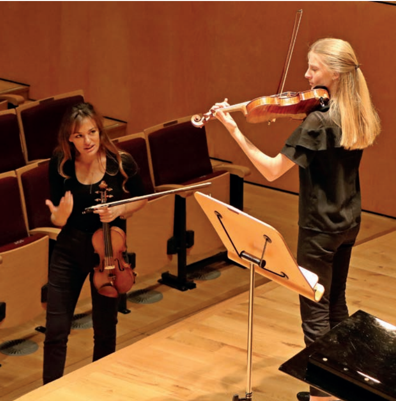
Masterclass with alumna Nicola Benedetti, 2019

Named after our founder, the Menuhin Circle brings together people who donate between £1,000 - £5,000 per year to our Annual Fund for a minimum of three years.